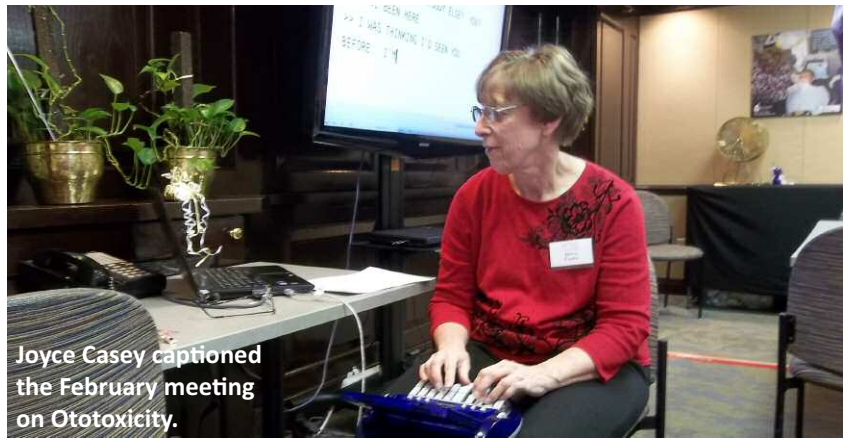
Joyce Casey captioned the February meeting on Ototoxicity.