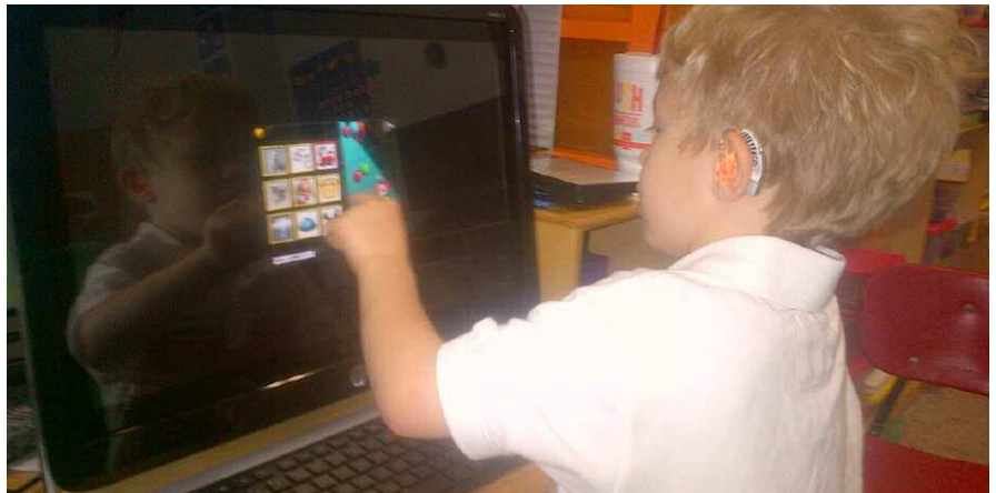
Funds from the HLLA Chattanooga Chapter helped to buy an "Earobics" program for the children at Marty's Center, a specialized inclusive program for children with hearing impairments, speech/language impairments, and regular education children ages 18 mo - 6 years.